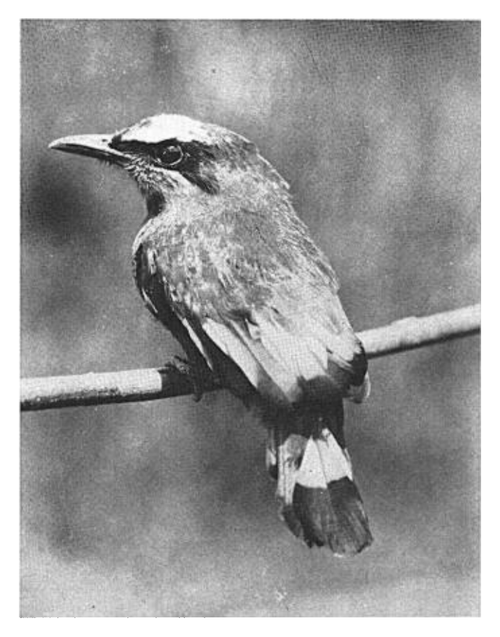
TURQUOISE-BROWED MOTMOT, TWENTY-SIX DAYS OLD.